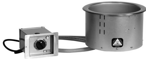
1100-RW (Insert pan not included)